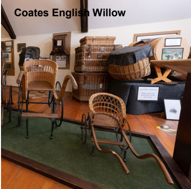
Coates English Willow

This morning, we have a guided walking tour of Torquay and discover more about Agatha Christie and her early years growing up in Torquay and visit the places which inspired her. We learn about her involvement in both World Wars and how her time spent preparing prescriptions proved invaluable for her plots. We’ll talk about her travels to the Middle East and her disappearance which created headlines across the world and discover how Miss Marple and Hercule Poirot were created. In the afternoon we visit Torre Abbey, Torbay’s most historic building, an Ancient Scheduled Monument dating back to 1196, set within 18 acres of garden and parkland. We enjoy a guided tour of the house tour which explores the history of Torre Abbey, the building’s varied architecture and extensive art collection while exploring the lives of those who previously lived here. Then there will be time to explore the garden which has a splendid collection of plants and trees and Agatha Christie inspired sinister 'Potent Plants Garden'.