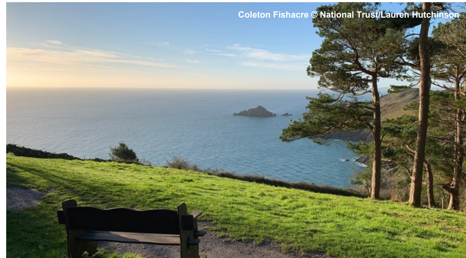
Coleton Fishacre